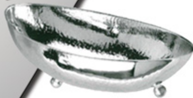
S/S BREAD BASKET, CURVED