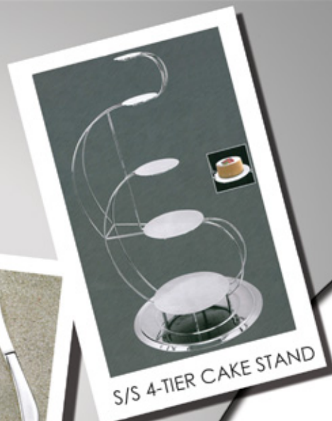
S/S 4-TIER CAKE STAND

For more information or a product catalogue, call your regular Sia Huat sales representative or our Customer Service Department at 62683922 today.