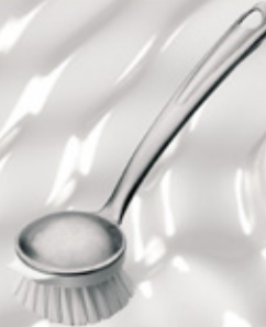
ST STEEL LONG HANDLE