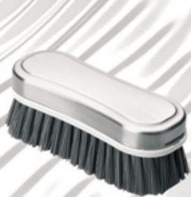
ST STEEL RECTANGULAR BRUSH