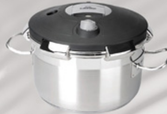
LUXE PRESSURE COOKER