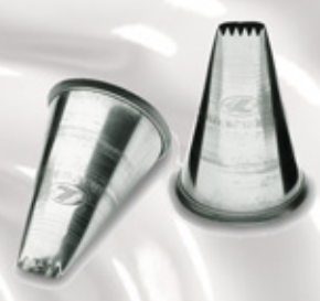
YULE LONG TUBE

Lacor - A brand that has been manufacturing cookware for half a century with its superior introduces a new range of products for 2nd half of 2007.