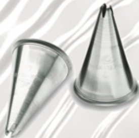
CLOSE STAR TUBE